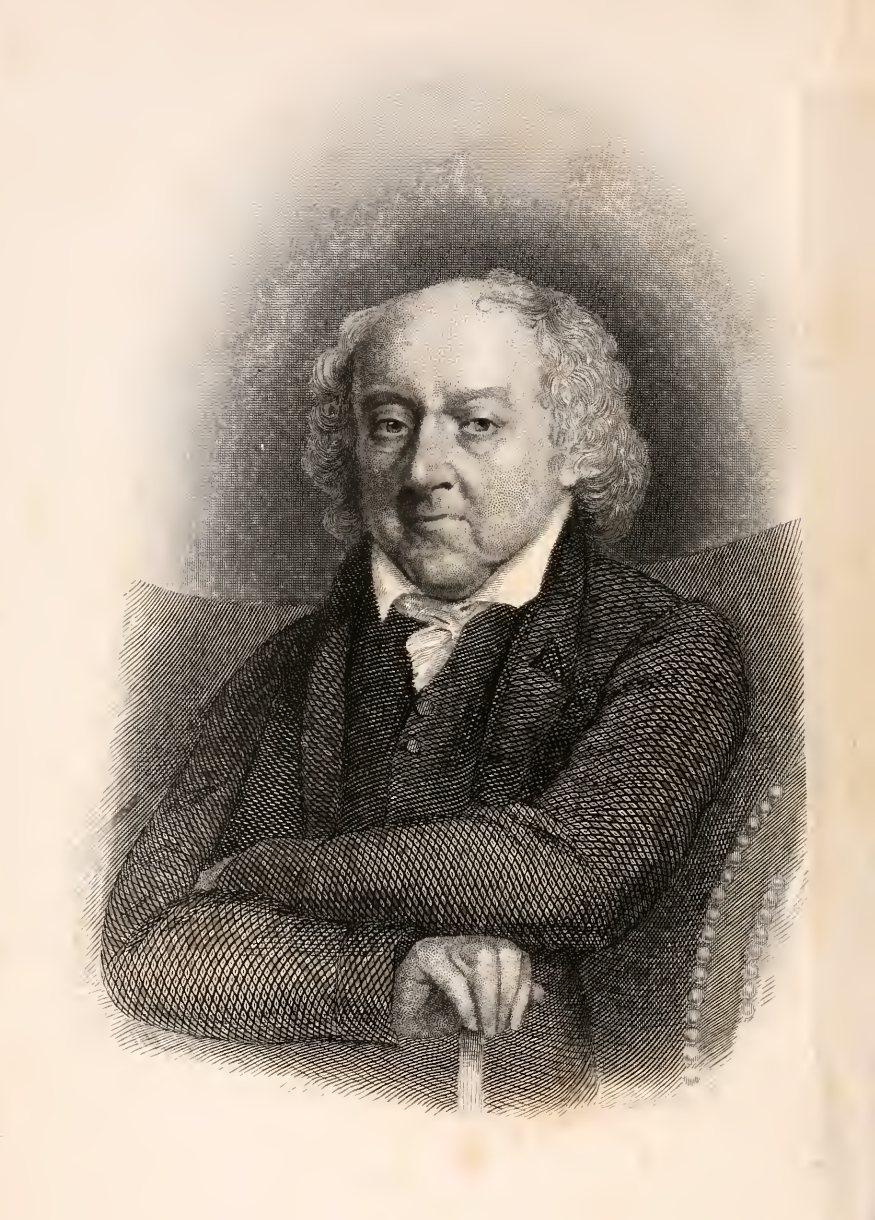
Teston PUBLISHED BY CHARLES CLITTLE & JAMES BELV